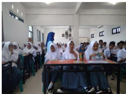
Day II: Tuesday, 28 August 2018